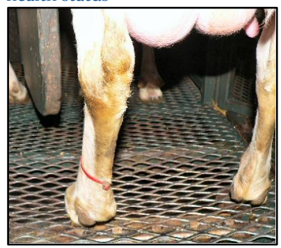
Fig. 1. Leg tie to identify udder health status

There are three common ways to manage these animals: