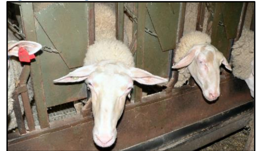
Fig. 6. Head gates. Ewes can't back out

When sheep enter the parlour and go into their individual milking stanchions, there are two options for the head: the head is not restrained, or their head goes through a headlock system, so they are only allowed minimal movement during milking. A locking headgate prevents ewes from moving excessively during milking and encroaching on other animals.