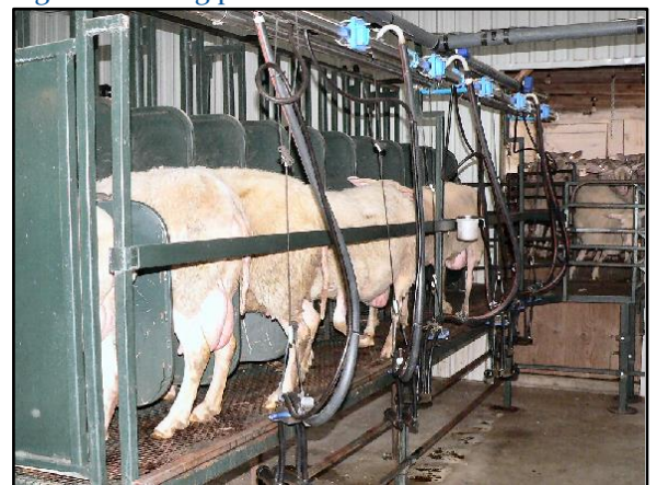
Fig. 2. Entering parlour. Milk from behind

When entering a parallel parlour, ewes walk straight into the parlour, and then when they reach their designated milking stall, they turn 90°, so they are standing away from the milker pit at a perpendicular angle (Fig. 2). These parlours allow for easy access to teats, as the ewe's legs do not block the udder and teats.