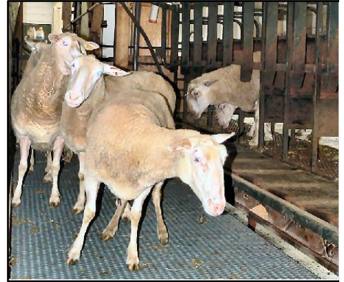
Fig. 5. Ewes exiting from the front

For the majority of the time, ewes will walk directly into the parlour without issue, however with younger or problem ewes, a producer may need to help guide them to the parlour. This can be done manually, by walking behind the ewes, directing them into the parlour, or automatically with a crowd gate, which pushes the group towards the parlour. It is important that this be done by moving quietly and not shouting or using physical force. Any nervousness will inhibit milk let-down and reduce milk production (see Section I.1.2.2).