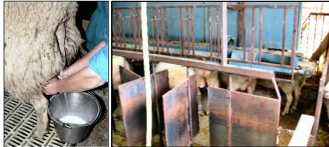
Fig. 11. Left – hand-milking; Right - hydraulic gate for releasing ewes from parlour

At the end of milking, sheep can exit the parlour in a variety of ways. In a parallel parlour, a rapid exit is a common system, where the front gate rises after milking, and all animals exit the parlour at the same time down the return lane to their housing pens (Fig. 11 - right). This exit system can also be done in batch or gang exits, where only a portion of animals are released at each time. This type of system tends not to use headgates. Exiting can also be done with the ewes backing up once released from the head gates. The head gate release is usually at one end of the parlour and all ewes are released at once. In a herringbone parlour, ewes exit the parlour in a single file and travel down the return lane back to their holding areas.