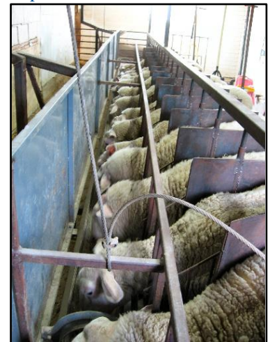
Fig. 7. Ewes eating concentrate in parlour

Mangers are often placed on the other side of the headlocks to offer a concentrate feed during milking. While this occupies the ewes, assures that each ewe has access to grain - and may help to bring nervous animals into the head gate readily, there are risks with this type of feeding that should be appreciated.