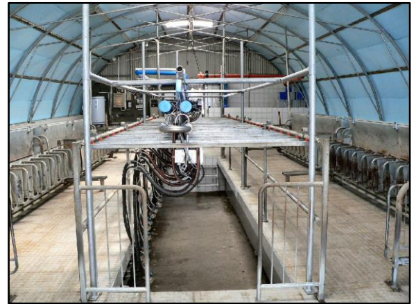
Fig. 1. Double-sided low-line parlour, milk from behind

Although these are very beneficial systems, it is important to understand the differences between parlours, how to manage each type properly, as well as how to manage ewes through these systems, from pre-milking to post-milking.